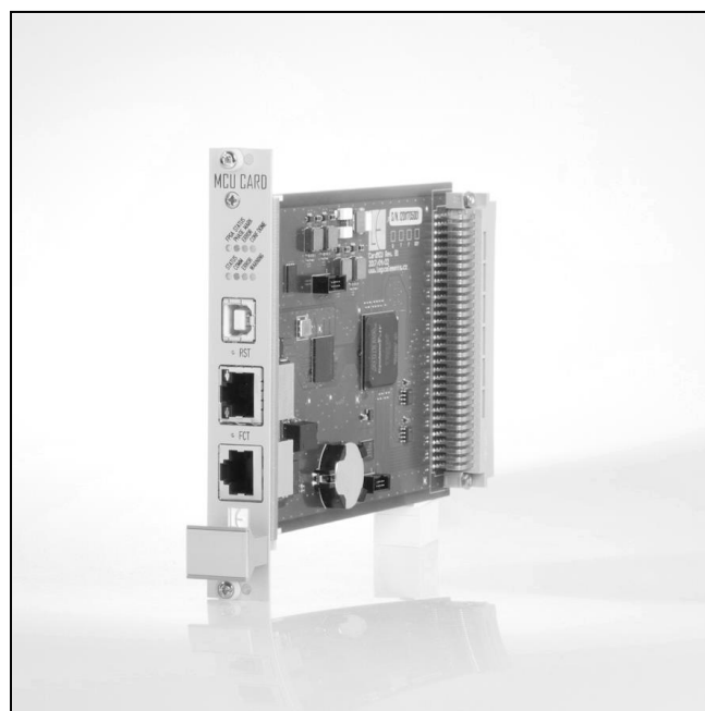
VMS-1201 – VMS Controller